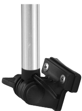
Fig. 1687 Horiz. Mt.