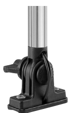
Fig. 1687 Vert. Mt.